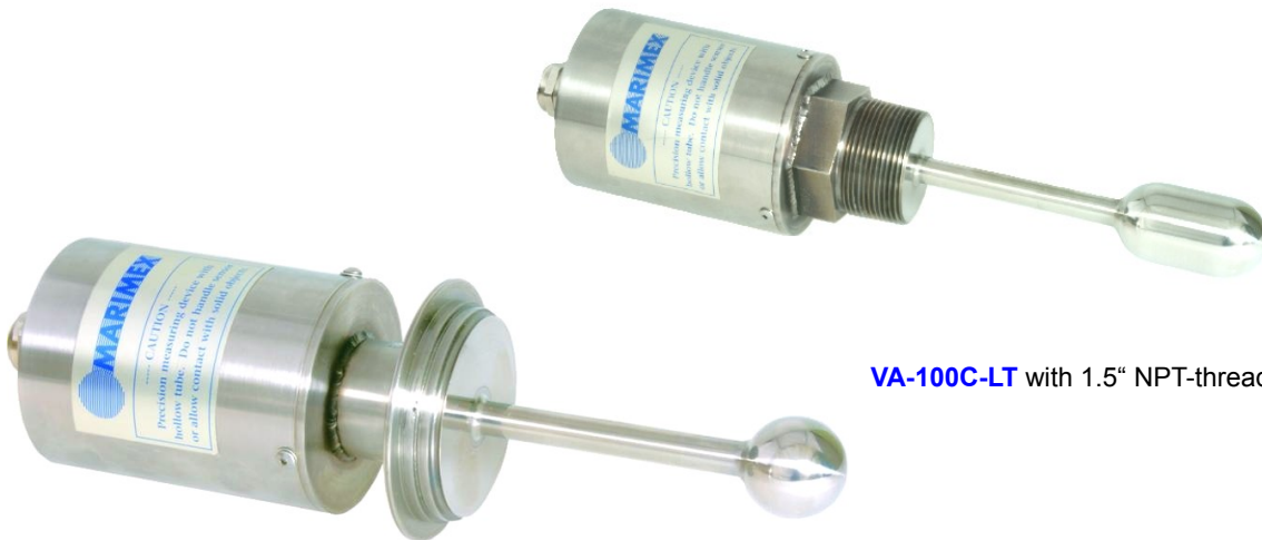
VA-100C-LT with 1.5" NPT-thread